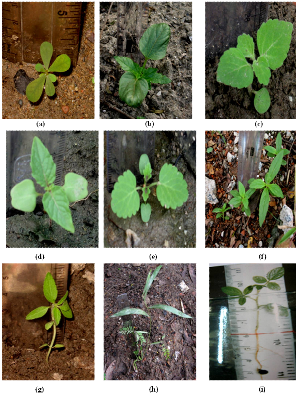
Plate VII : Seedling morphological diversity among the investigated taxa.